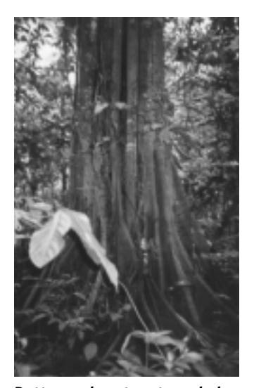
Buttressed root systems help support some rainforest trees.

The "tropical rainforest" is an environment which almost defies description. Here we botanized, hiking through a forest containing huge trees. Some had a buttressed root system which is a special adaptation to the shallow, infertile soils of the rainforest. The best way to learn the rainforest is to spend some time there. Birding here is good in that there are lots of species. There are 1,500 species in Ecuador. The biggest challenge to birding is identifying them. Since I had never before seen most of the birds I encountered, it was a matter of writing a hurried description in the field then searching bird identification books for a