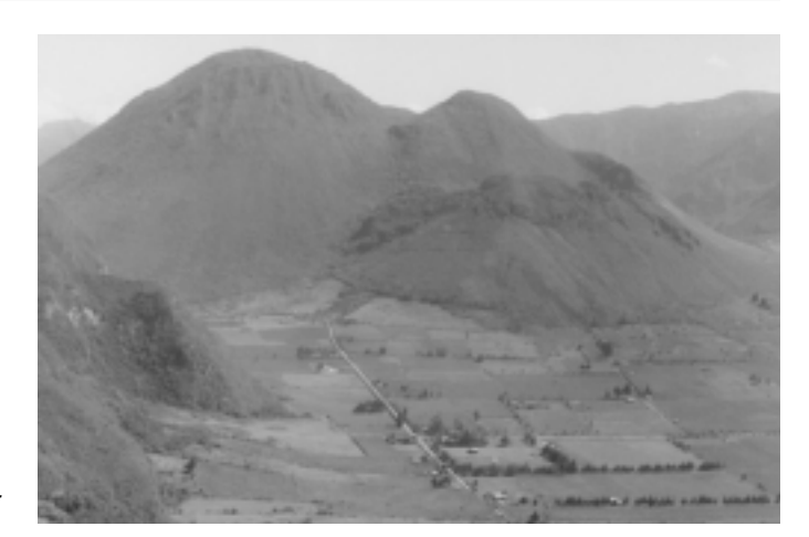
Farming the rich soil in the caldera of an extinct volcano.

The Galapagos Islands were all that we've read about and then some — famous as one of the most significant stops on the voyage of the Beagle in 1835 and for the studies of Charles Darwin. We saw several of "Darwin's finches," and also learned