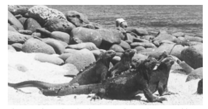
Giant tortoise and marine iguanas: unique Galapagos residents.