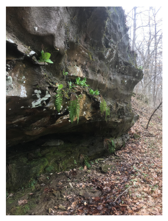
Sandstone rock outcrop along Rough River in Grayson County Kentucky. French's shooting star ( Dodecatheon frenchii ) and wood fern ( Dryopertis marginalis ) can be seen on the sandstone outcrop. French's shooting star is a state listed plant and in Kentucky occurs mainly in the sandstone outcrops of the Shawnee hills region.

The activities and programs discussed above are funded almost entirely through membership dues. If you haven't already done so, now would be a great time to join the Kentucky Native Plant Society or, if already a member, to renew your membership. By renewing you will continue your support of the Society's activities.