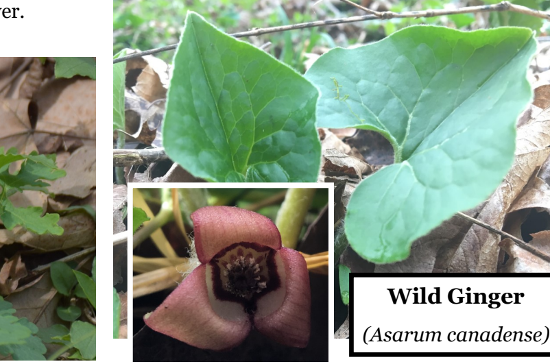
Look for low-growing heart-shaped leaves to find wild ginger, then gently check at the bases of paired hearts to find the tiny flower, often resting beneath leaf litter.