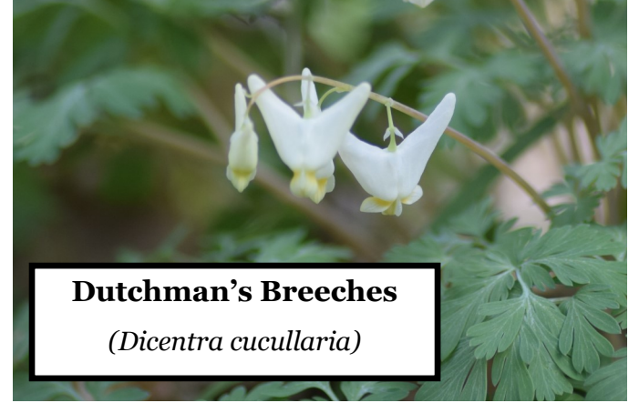
Fine, feathery foliage with flowers that resemble upside-down pantaloons.