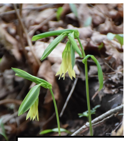
Large-flowered Bellwort (Uvularia grandiflora)