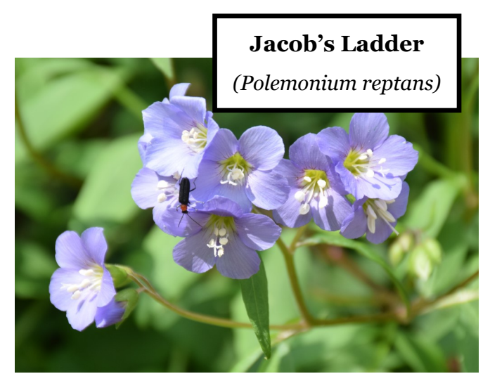
About 1 ft tall, with ladder-like compound leaves and soft bluish/lavender flowers with 5 petals