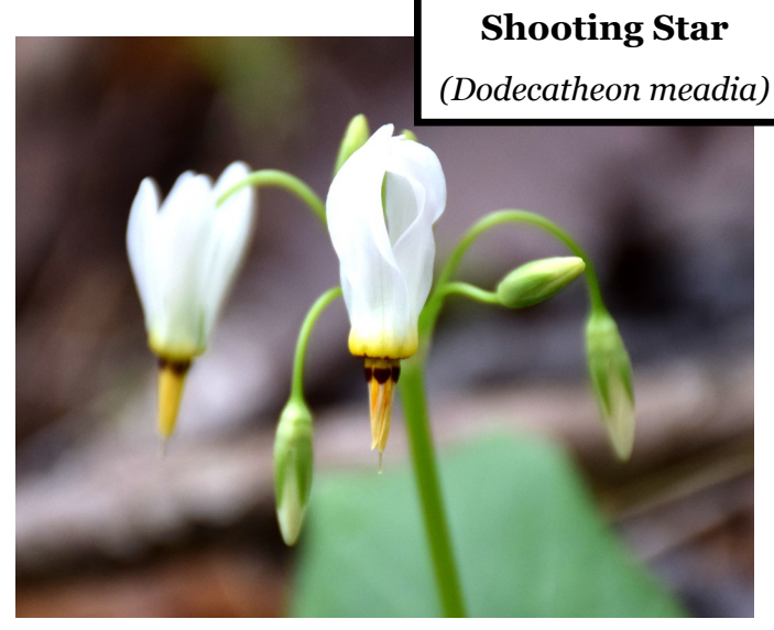
A cluster of descending flowers on a tall stalk above a large rosette of leaves