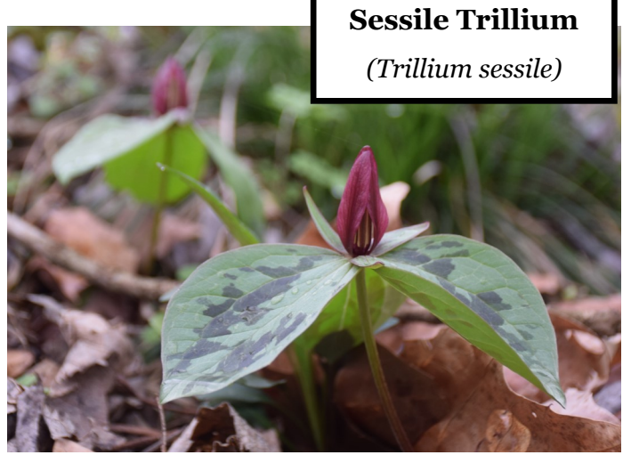
Often only a few inches high with three mottled leaves and a dark red flower