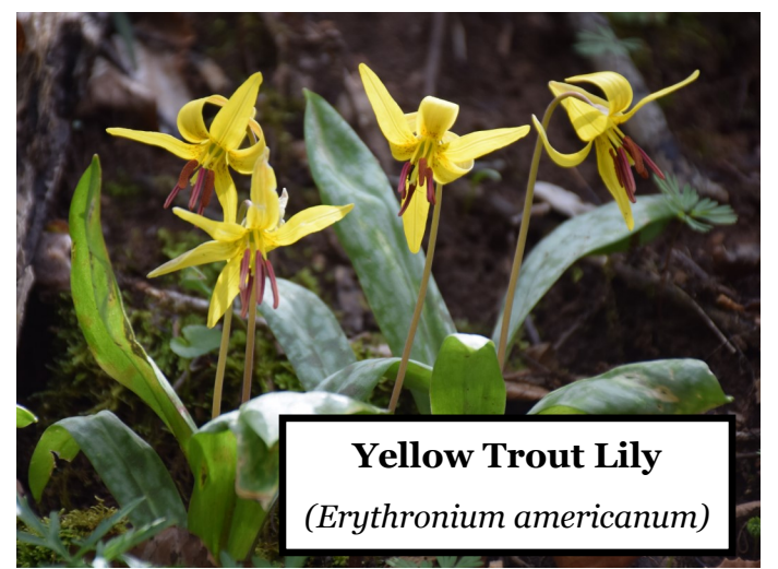
Trout lilies form massive colonies of beautiful mottled leaves, but many never flower.