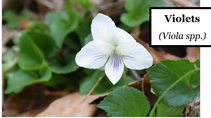
This one is called striped white violet, but there are lots of different kinds of violets on the trail—blue, white, and yellow! How many can you find?